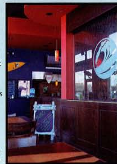
Costa Vida Restaurant Interior

Their hours are 11 a.m.-10 p.m. on Friday and Saturday, 11 a.m.-9 p.m. Sunday-Thursday. Call ahead for take out and enjoy! 817.656.1700. Casual, no reservations required.